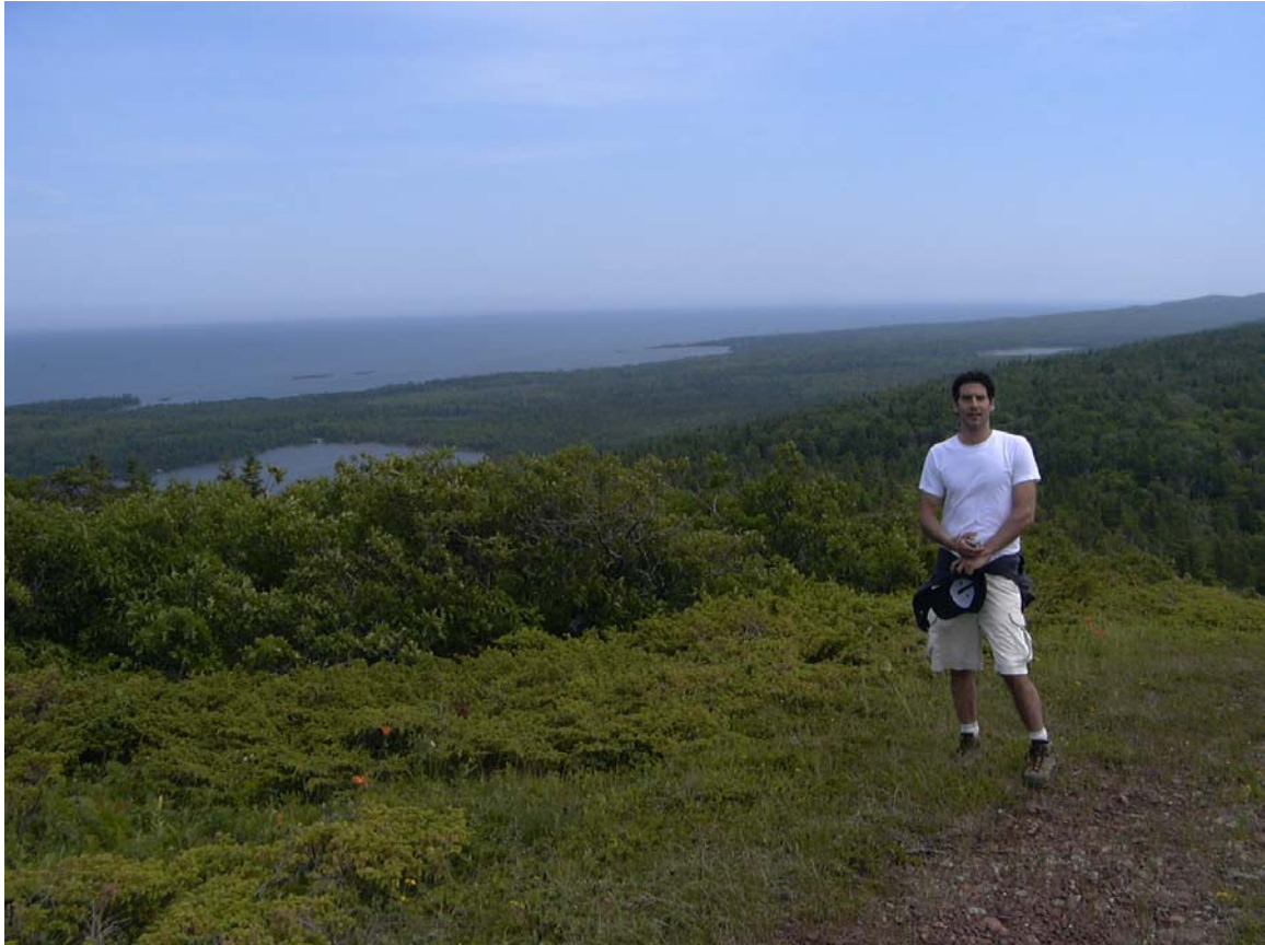
The Nature Conservancy Mt. Baldy Preserve along the proposed KEWEENAW TRAIL System

The KEWEENAW TRAIL supports the ecology of the area through the concept of contiguous large-scale multi-jurisdictional conservation. This has not been done before on the Keweenaw Peninsula. By protecting large wildlife corridors that contain different but integral ecosystems, the peninsula will benefit as a unified ecosystem.