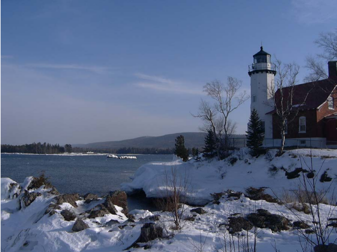
Eagle Harbor Lighthouse

By working with the Keweenaw Historical Society and the United States National Park Service, the historical story of the Keweenaw can be enhanced by providing non-motorized access through the beautiful natural resources of the area.