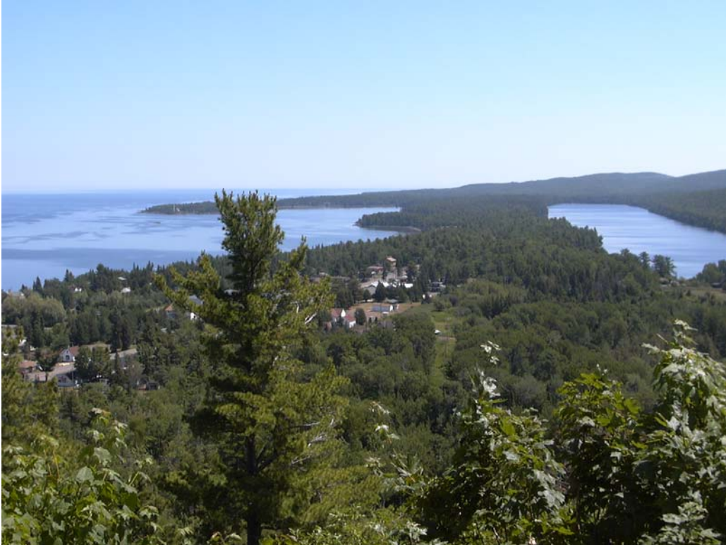
Copper Harbor Overlook, Mt Brockway