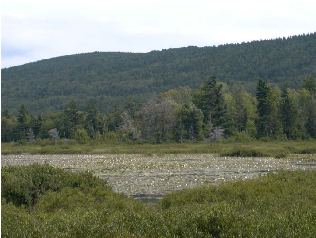
The Nature Conservancy Mt. Baldy Preserve