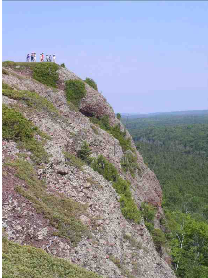
KEWEENAW RIDGE TRAIL, EAGLE HARBOR TOWNSHIP

IN PARTNERSHIP WITH: EAGLE HARBOR TOWNSHIP GRANT TOWNSHIP HOUGHTON TOWNSHIP WESTERN UPPER PENINSULA PLANNING AND DEVELOPMENT REGION